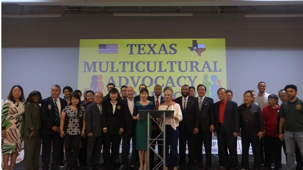
The Texas Multicultural Advocacy Coalition Civil Rights Town Hall Meeting

The Texas Multicultural Advocacy Coalition (TMAC) is a coalition of multicultural groups in Houston that is dedicated to promoting justice and progress for marginalized communities. Comprising a diverse range of organizations, the coalition works to raise awareness about issues affecting communities of color, advocate for policy changes, and promote collective action to achieve greater equity and social justice. By bringing together different communities and organizations, TMAC aims to create a more inclusive and equitable society for all.