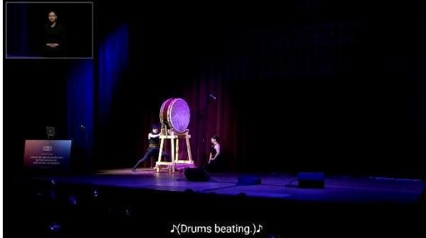
The 2023 White House Forum on Asian Americans, Native Hawaiians, and Pacific Islanders

On May 3, 2023, the White House celebrated Asian American, Native Hawaiian, and Pacific Islander Heritage Month with a community-wide program in Washington, DC. This historic forum on Asian American, Native Hawaiian, and Pacific Islander communities features Biden-Harris Administration officials, groundbreaking artists, and trailblazers. Watch the video at https://bit.ly/3BwrPZ9 (video 4:35:34)