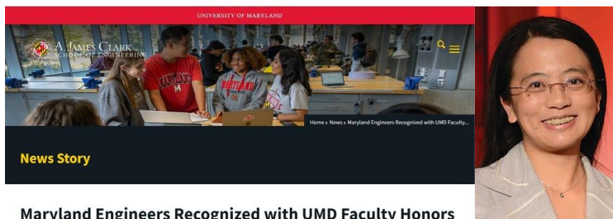
Maryland Engineers Recognized with UMD Faculty Honors