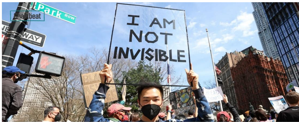
New Yorkers gathered at City Hall to protest anti-Asian hate, March 22, 2021.